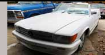
1973 Mercedes SL 450 Convertible