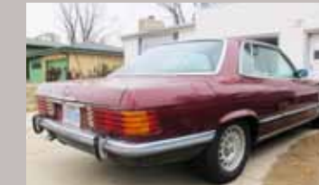
1973 Mercedes SLC 450