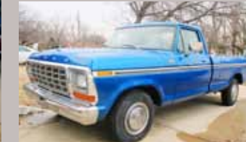
1979 Ford F-250