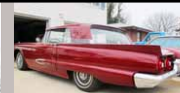
1959 Ford Thunderbird

Great 3+ Bedroom, 2.5 Bath home with 2 car attached garage selling at Absolute Auction. Nice location, large back yard with storage shed, large living room with floor to ceiling brick fireplace. Formal dining room. Also offering 5 vehicles including: 1959 Ford Thunderbird, 1973 Mercedes SL 450 Convertible, 1979 Ford F-250, 1973 Mercedes SLC 450, and 1968 Mercedes 250. See website for additional pictures and detailed information. Earnest Deposit: $3,500; Year Built: 1955; SF: 2,595; Gen. Tax: $1,542.08; No specials. (Mt. Vernon & Hillside - South on Hillside to Clark St., East on Clark to home. Home is on the South Side of Clark.)